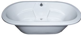
Tub pictured with optional waste & overflow.

Always check the website for the most updated specifications: www.americh.com